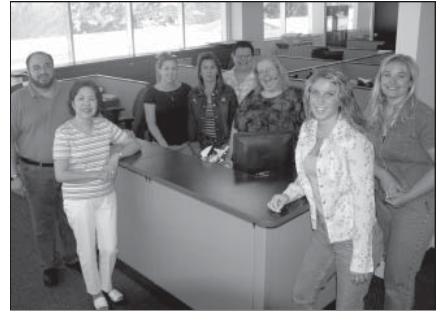
Vacaville Sanitary Service staff are ready to help customers from the new office on the second story of the new library at 1 Town Square, Suite 200 in Vacaville. The new office provides improved customer access to services in the downtown Vacaville area.

The administrative staff of Vacaville Sanitary Service are now