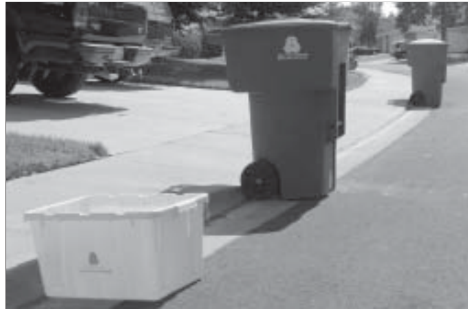
Keep at least 5 feet between toters and yellow recycling bin. Place the containers on the street next to the curb. The automated trucks have difficulty collecting toters and bins that are not placed out properly.

days. The automated collection system requires at least 5 feet of space between containers.