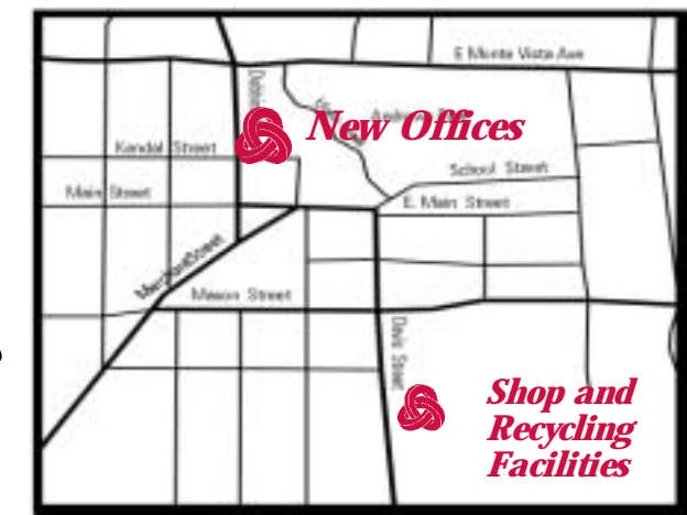
Look for the new VSS offices downtown in Vacaville. The new address is 1 Town Square Place, Suite 200. We are above the new library. The shop and recycling facilities are still located at 855 1/2 Davis Street.

"There currently are no signs out front," explains Farewell. "This has caused some confusion. Just look for the new library which is off of Dobbins Street. We are upstairs. Hopefully, the signs will be up soon to help guide customers to us."